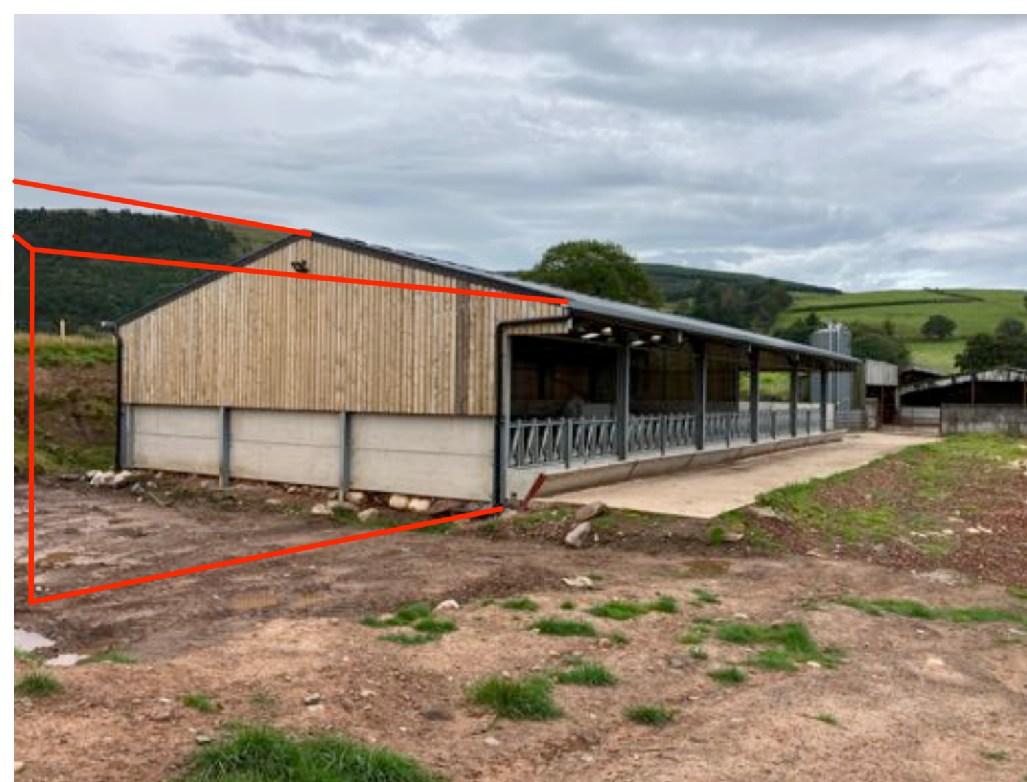
EXTENSION TO NORTHERN GABLE BY TWO BAYS TO CREATE MIDDEN