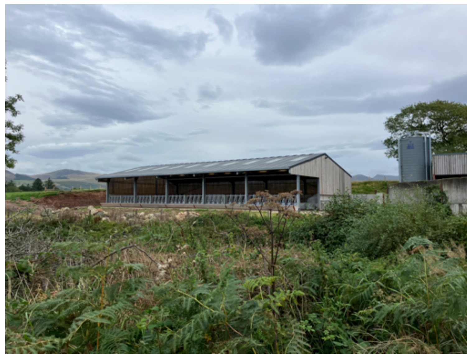
CURRENT BUILDING PLANNING CONSENTED REF 7/2020/4041