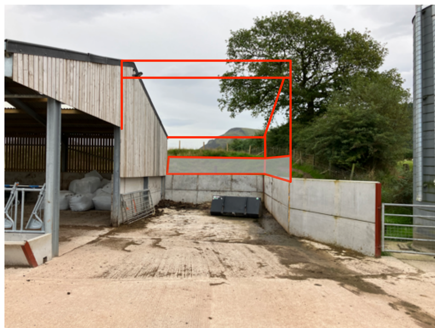
EXTENSION TO SOUTHERN GABLE TO ROOF OVER MIDDEN AND RAISED ONE CONCRETE PANEL